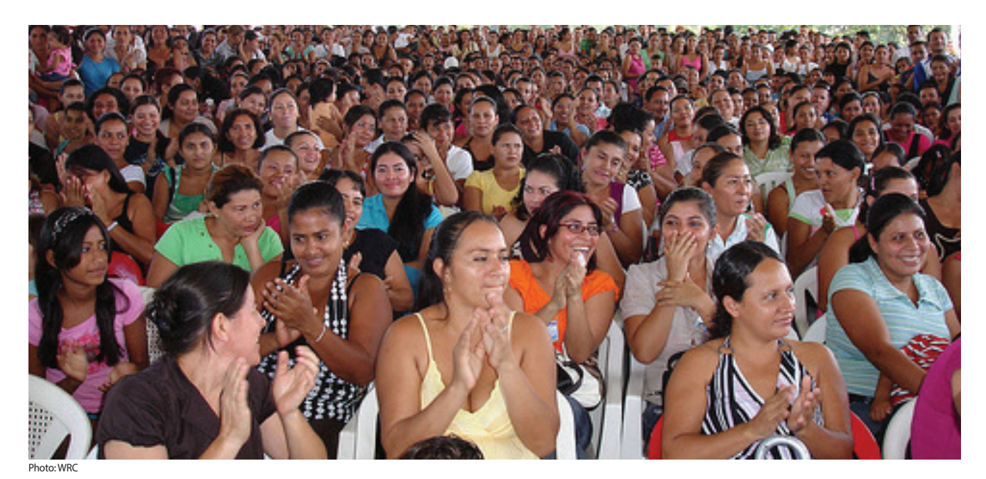
RESPONSIBILITY OUTSOURCED: SOCIAL AUDITS, WORKPLACE CERTIFICATION AND TWENTY YEARS OF FAILURE TO PROTECT WORKER RIGHTS

Ignoring the FLA's defense of Russell's closure decision, numerous universities ultimately chose to strip Russell of its licensing rights; eventually, more than 100 universities took this action. The pressure brought Russell to the negotiating table with the CGT in October 2009. The local union and national CGT signed a groundbreaking labor rights agreement with the employer. Russell agreed to reopen the factory under a new name, rehire all of the